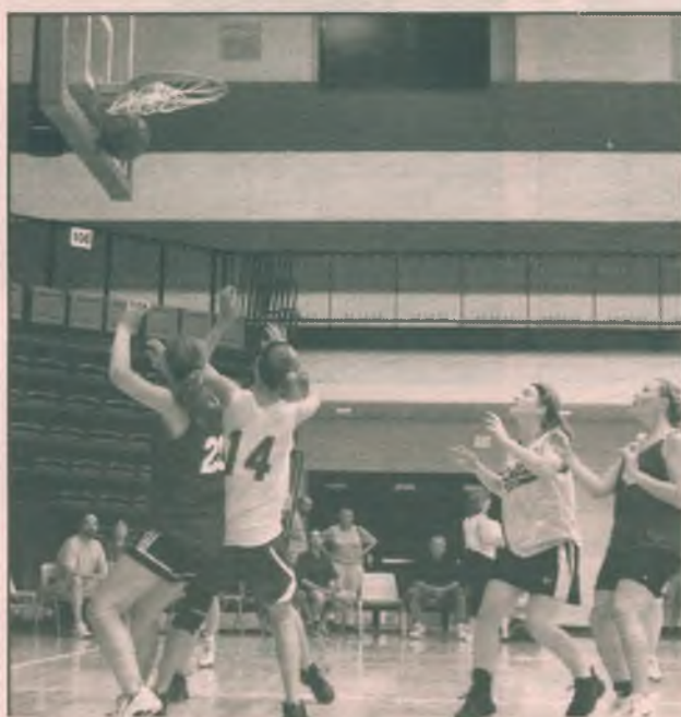
Girl's basketball campers play on the Vadalabene Center floor Saturday. The floor will have to be replaced after a moisture test revealed problems below the surface following a recent storm.

Caitlin Doszkewycz can be reached at cdoszke@siue.edu or 650-3524.