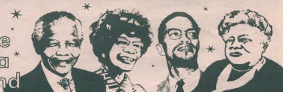
Left to right: Nelson Mandela, Shirley Chisholm, Malcolm X and Mary McLeod Bethune