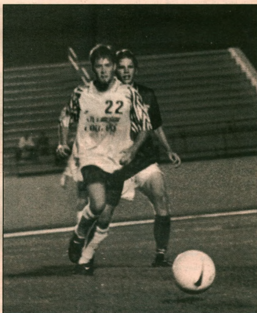
Kickin' it up

SIUE sees more GLVC action next weekend as the Cougars face Wisconsin-Parkside Friday at 7 p.m. in Kenosha, Wis. On Saturday, SIUE takes on conference foe Lewis and Ferris State at 10:30 a.m. and 12:30 p.m., respectively, in Romeoville, Ill.