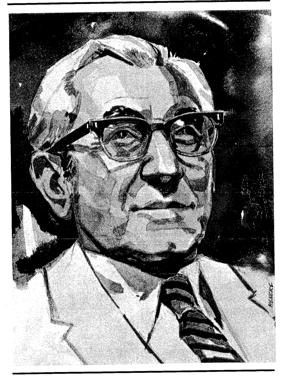
Southern Illinois University / Carbondale and Edwardsville 1969-70