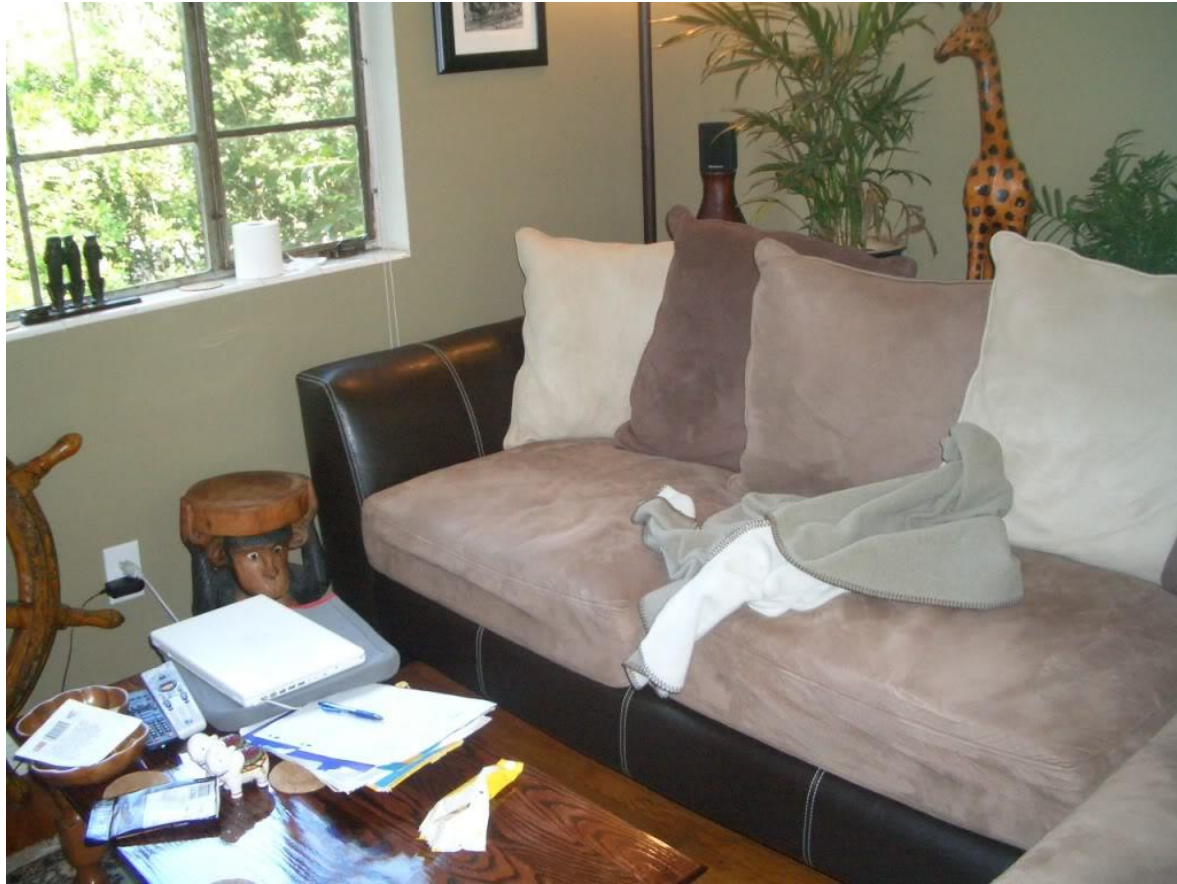
Photo diary photograph showing a laptop by a sofa as “favorite place to study and/or conduct research.”